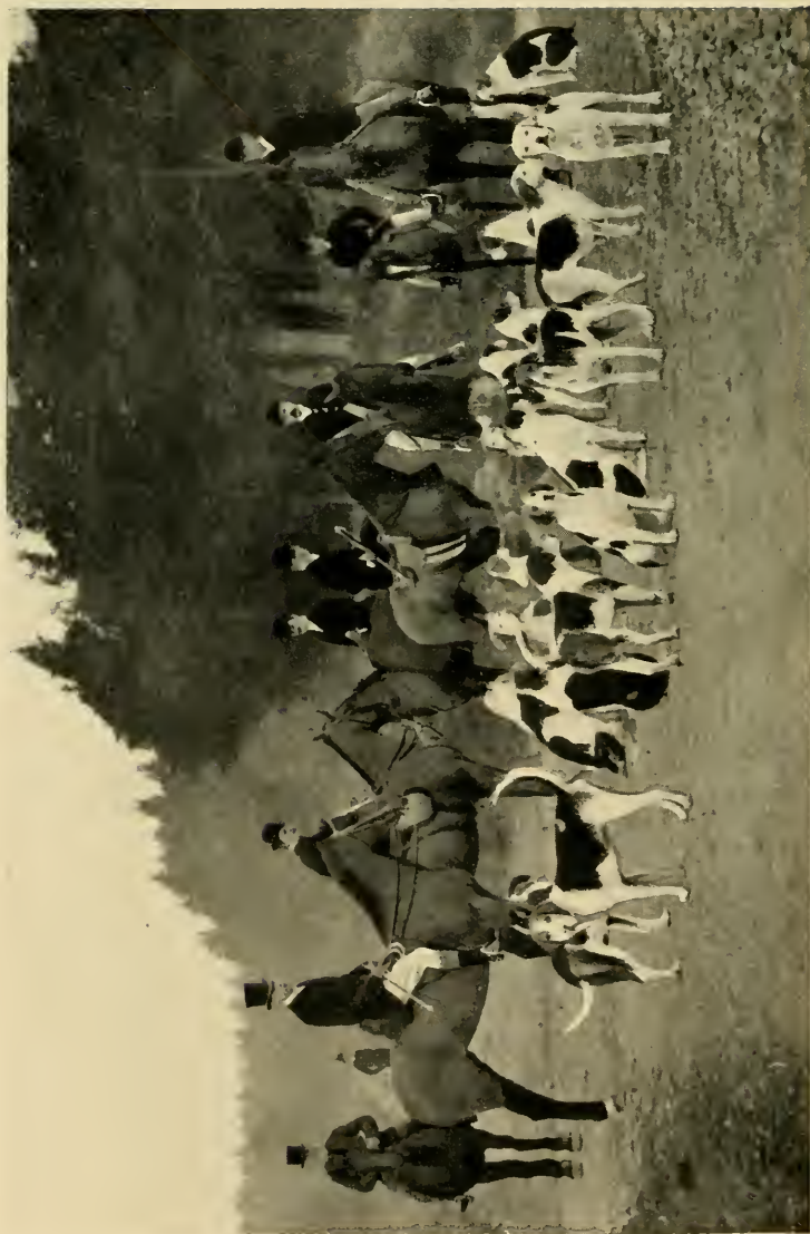
THE SOUTH DEVON (EXETER DIVISION) AT THE ROUND O. 1889